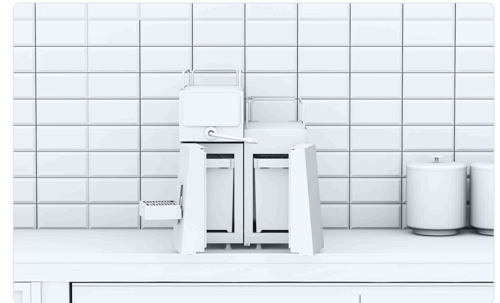
Extra fridge setup: 2x 3.7L (1 gal) containers