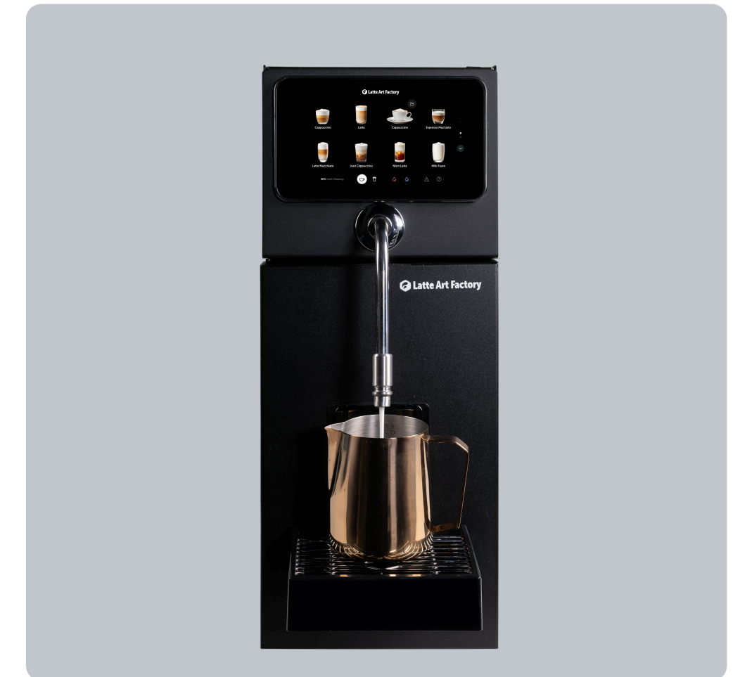
LAF Classic – full unit on counter (including fridge)